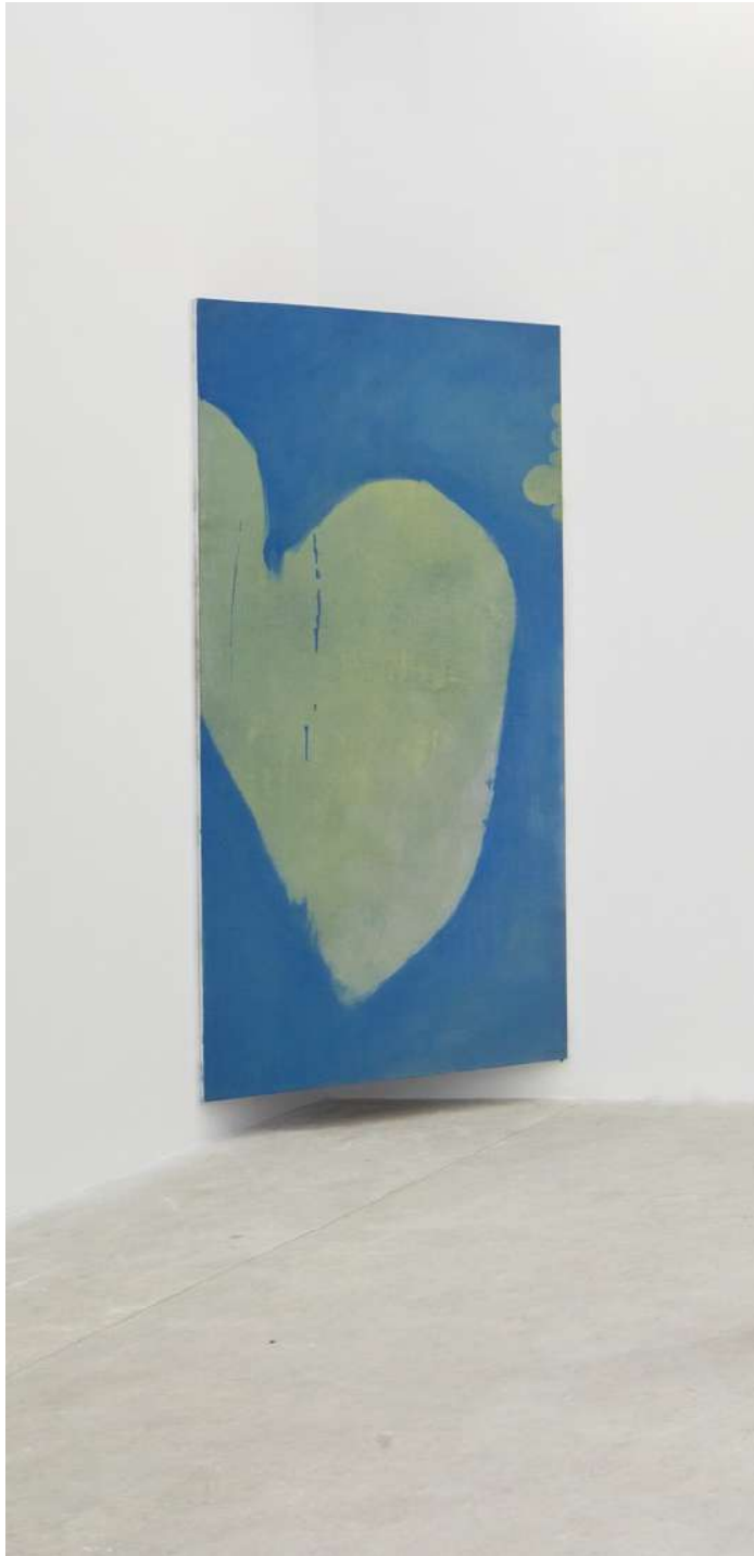
Alonso Leon-Velarde Britney's song (view of installation) 2020 Oil on linen 200 x 91 cm