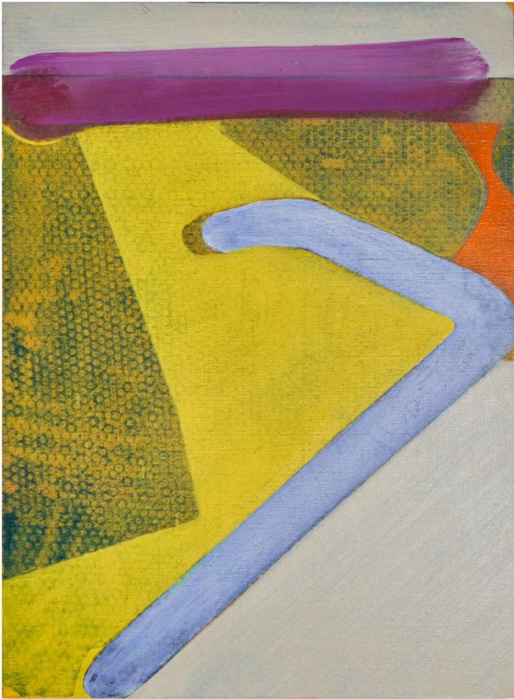
Alonso Leon-Velarde Men who buy Kleenex 2020 Oil on linen 50 x 40 cm