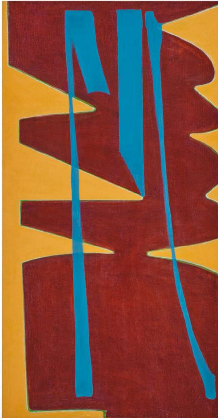
Alonso Leon-Velarde Also drink melón juice 2020 Oil on linen 96 x 50 cm