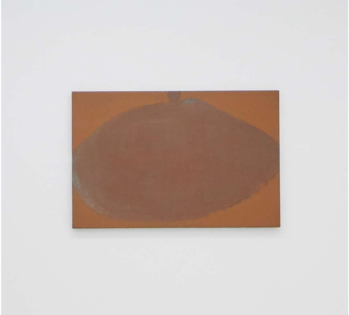
Alonso Leon-Velarde Hoghead leaf (view of installation) 2020 Oil on linen 90 x 62 cm