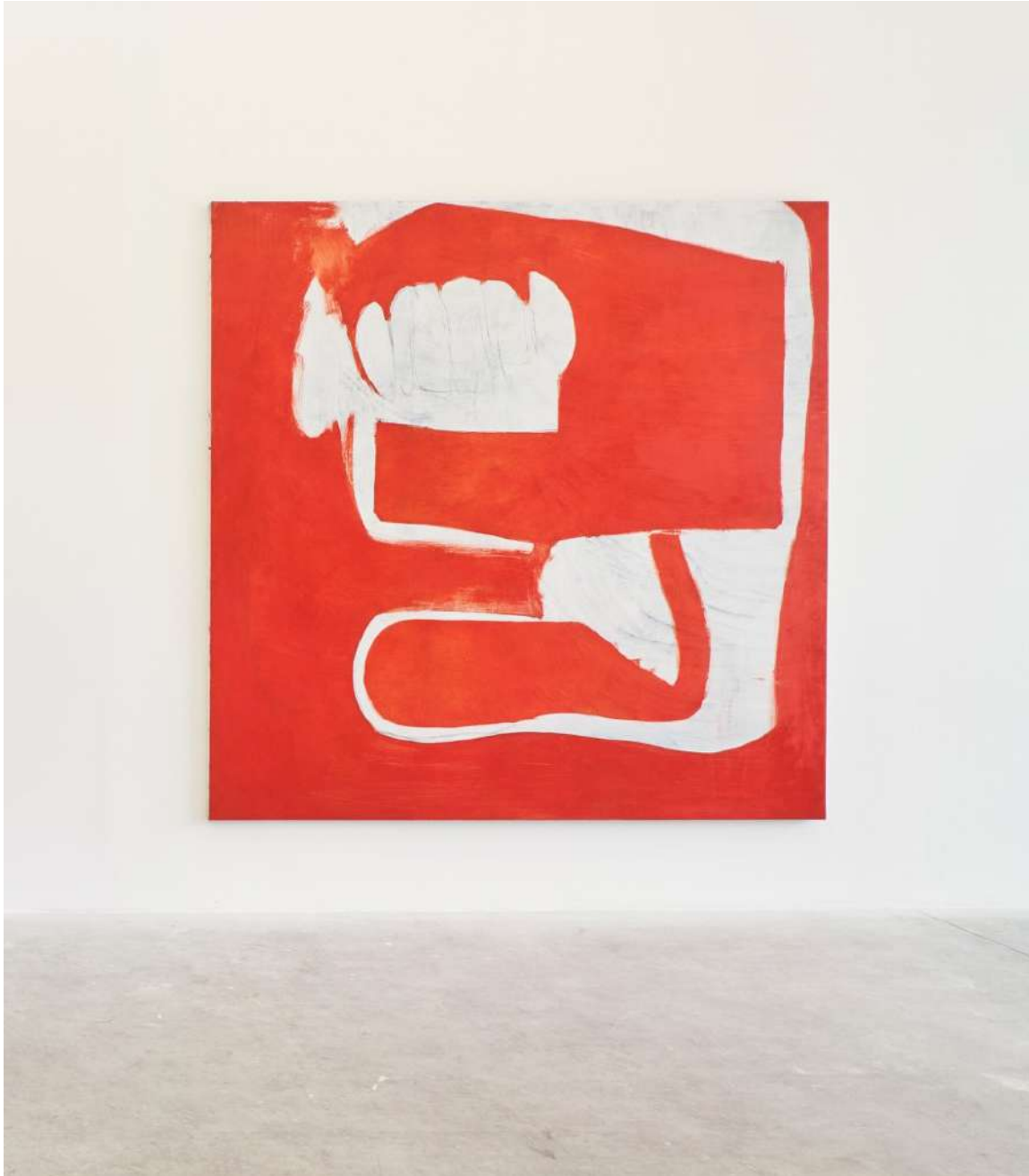
Alonso Leon-Velarde British teeth (view of installation) 2020 Oil on linen 200 x 200 cm